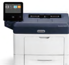
Xerox® VersaLink B400 Printer