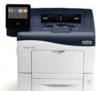
Xerox® VersaLink® C400 Color Printer